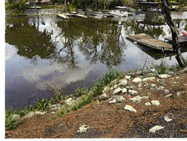
8 SCHEDULE 2 - STA 31+50 SCALE: N.T.S.