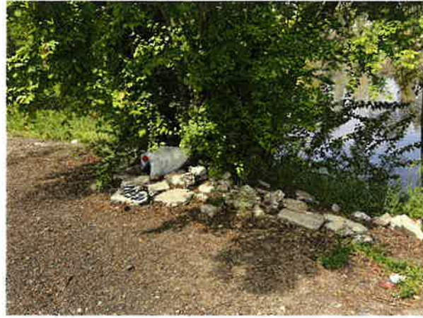
2 SCHEDULE 4 - STA 20+00 SCALE: N.T.S.