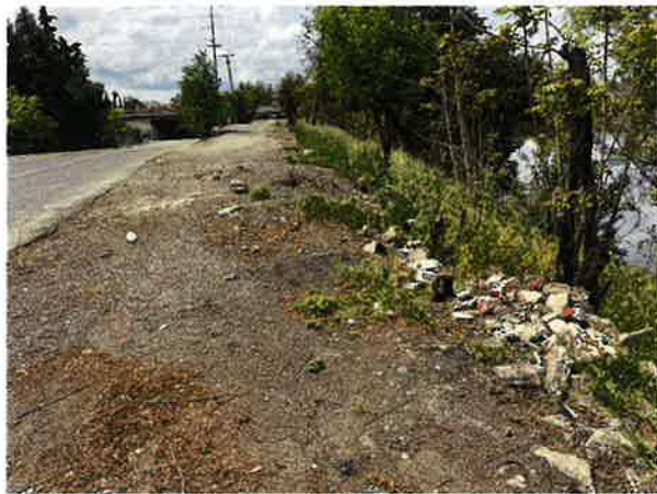
5 SCHEDULE 4 - STA 56+00 SCALE: N.T.S.