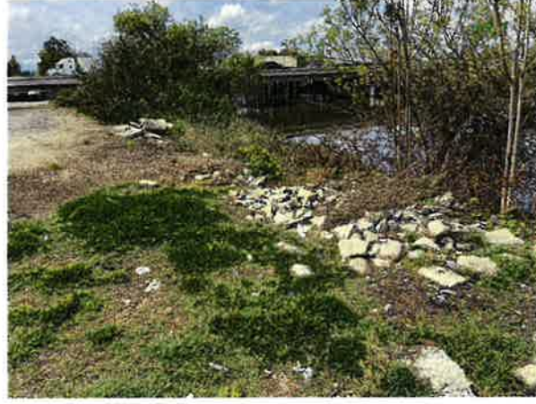
10 SCHEDULE 2 - STA 57+00 SCALE: N.T.S.