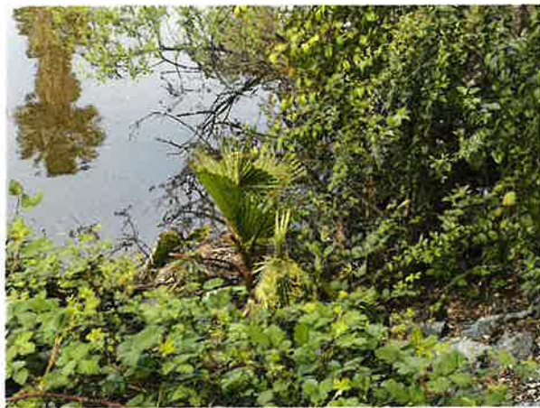
1 SCHEDULE 1-1 - STA 52+00 SCALE: N.T.S.