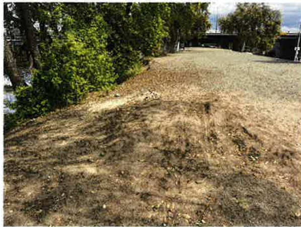
6 SCHEDULE 4 - STA 63+75 SCALE: N.T.S.

FILE SPEC: P:\1204_RD_82B-Weber_Tract\0230_Annual_Maint_Bid_Civil\400_Plans\020_CAD_Sheets\C-601.dwg PLOT DATE: Sep 25, 2025 - 2:24pm