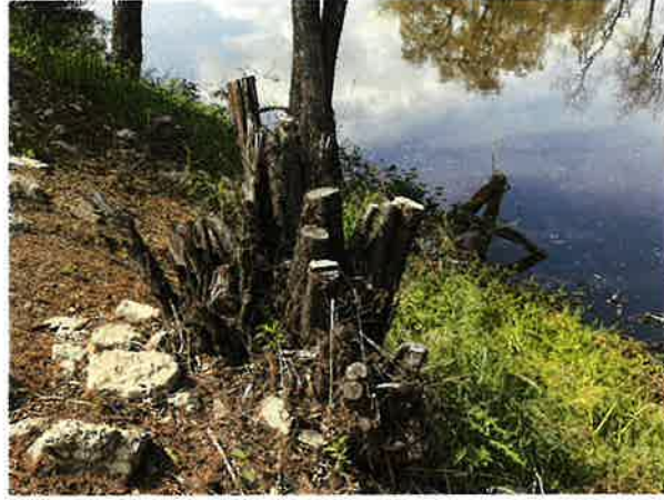
6 SCHEDULE 1-2 - STA 54+50 SCALE: N.T.S.