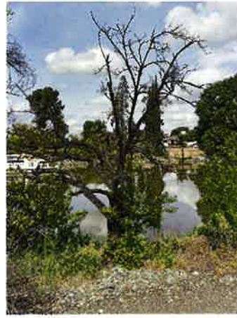
3 SCHEDULE 1-2 - STA 36+25 SCALE: N.T.S.