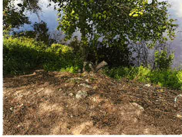
7 SCHEDULE 1-2 - STA 54+50 SCALE: N.T.S.