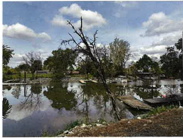
2 SCHEDULE 1-2 - STA 31+50 SCALE: N.T.S.