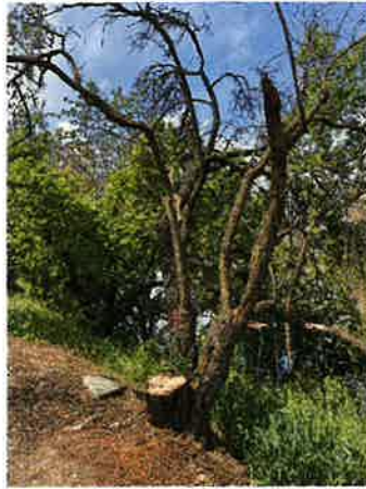
5 SCHEDULE 1-2 - STA 53+75 SCALE: N.T.S.