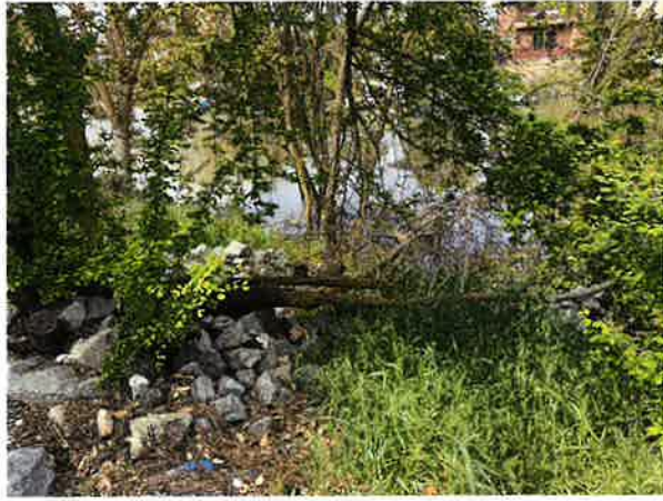
9 SCHEDULE 2 - STA 52+50 SCALE: N.T.S.