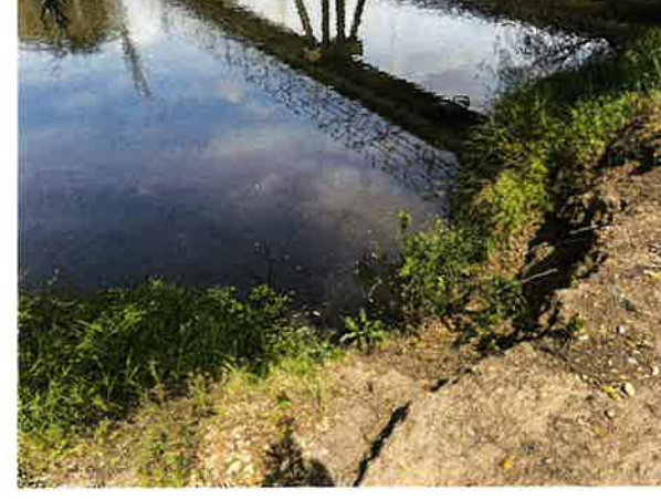
12 SCHEDULE 2 - STA 63+25 SCALE: N.T.S.

FILE SPEC: P:\1204_RD_828-Weber_Tract\2025-Annual_Maint_Bid_Projects\2025-2026\08_Civil\400_Plans\020_CAD_Sheets\C-601.dwg PLOT DATE: Sep 25, 2025 2:24pm