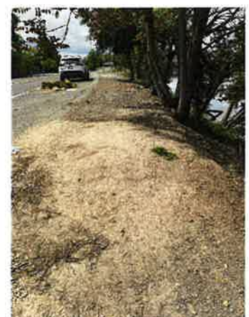
4 SCHEDULE 4 - STA 54+00 SCALE: N.T.S.