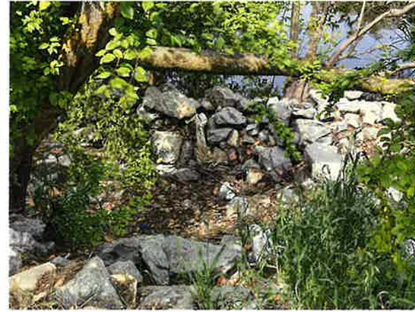
3 SCHEDULE 4 - STA 52+25 SCALE: N.T.S.