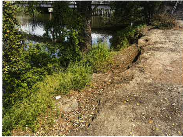
1 SCHEDULE 2 - STA 63+25 SCALE: N.T.S.