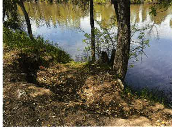
11 SCHEDULE 2 - STA 62+75 SCALE: N.T.S.