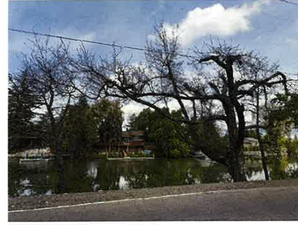
4 SCHEDULE 1-2 - STA 40+50 SCALE: N.T.S.